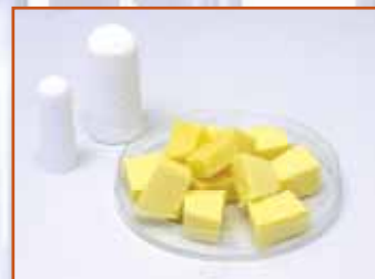
Fat determination in food and feed