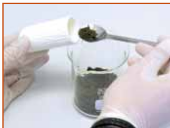
Analysis of soil contaminants

Extraction thimbles are often used in Soxhlet extractors or automated extractors. These are typically employed, where multiple extraction cycles are required to dissolve the desired compound. Extraction units equipped with MN extraction thimbles minimize the hands-on time and ensure a complete extraction .