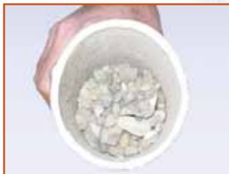
Determination of binder content in asphalt